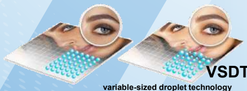
variable-sized droplet technology